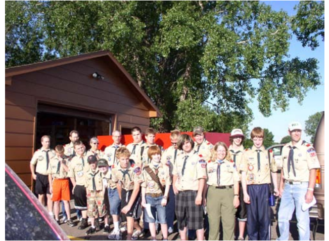
Troop 510 ready to go to Tomahawk on Saturday, July 11, 2009